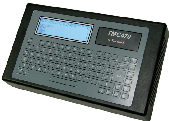
Compact Self-Contained TMC470 Controller — no PC required.