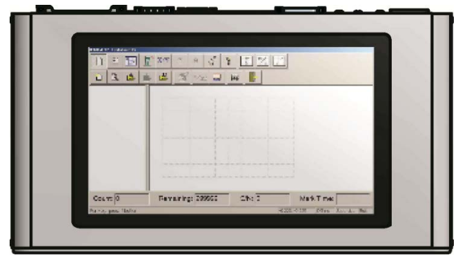
TMC600 Controller with Touch Screen Monitor and MerlinTouch PS Software

The top panel of the controller contains an integrated, 10-in., high resolution, touch screen monitor. The monitor displays the MerlinTouch PS software and provides the user interface for operating the marking system.