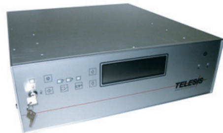
Model E10 Series Controller