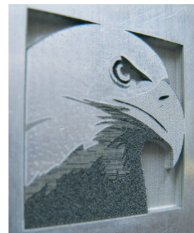
Engraved approximately 4mm deep in aluminum

*MOTF Versions and embedded PC versions available at an additional charge